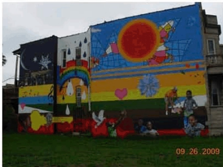
This mural is on the building next to the Chicago 1 st Church of the Brethren.