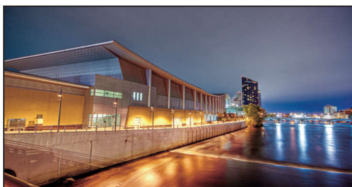
DeVos Convention Center