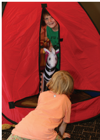
AC 2013