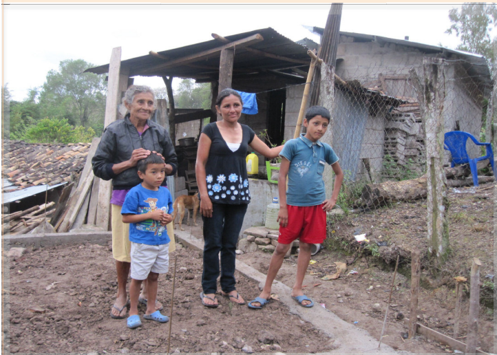
A family in Trinidad de Copan stands by the foundation of their new home being built with the assistance of the village and volunteers.