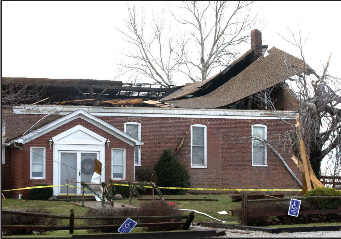
Oakley Brick Church of the Brethren damage.

On Dec. 23, 2015, the Oakley Brick Church of the Brethren, near Cerro Gordo, IL, was heavily damaged by strong winds. The building has been weakened to the point that its future is uncertain but the congregation remains strong. They continue worshiping together in the Brintlinger and Earl Funeral Home in Cerro Gordo with an average of 40 in attendance. The spirit of the congregation is high as they patiently wait to learn what next steps will be regarding the status of the damaged building.