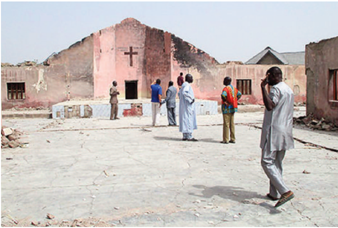
One of the destroyed churches in Nigeria

Church of the Brethren Newsline August 19, 2016