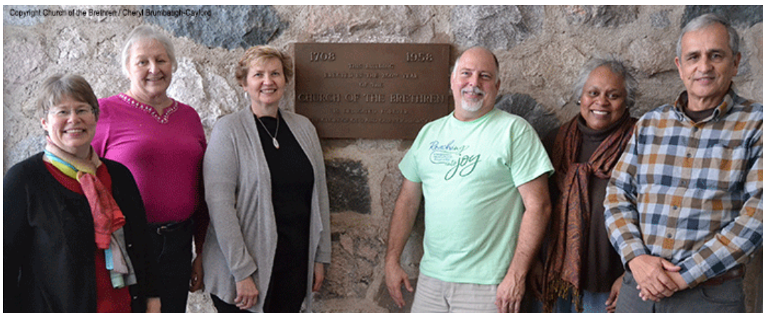
NOAC 2021.